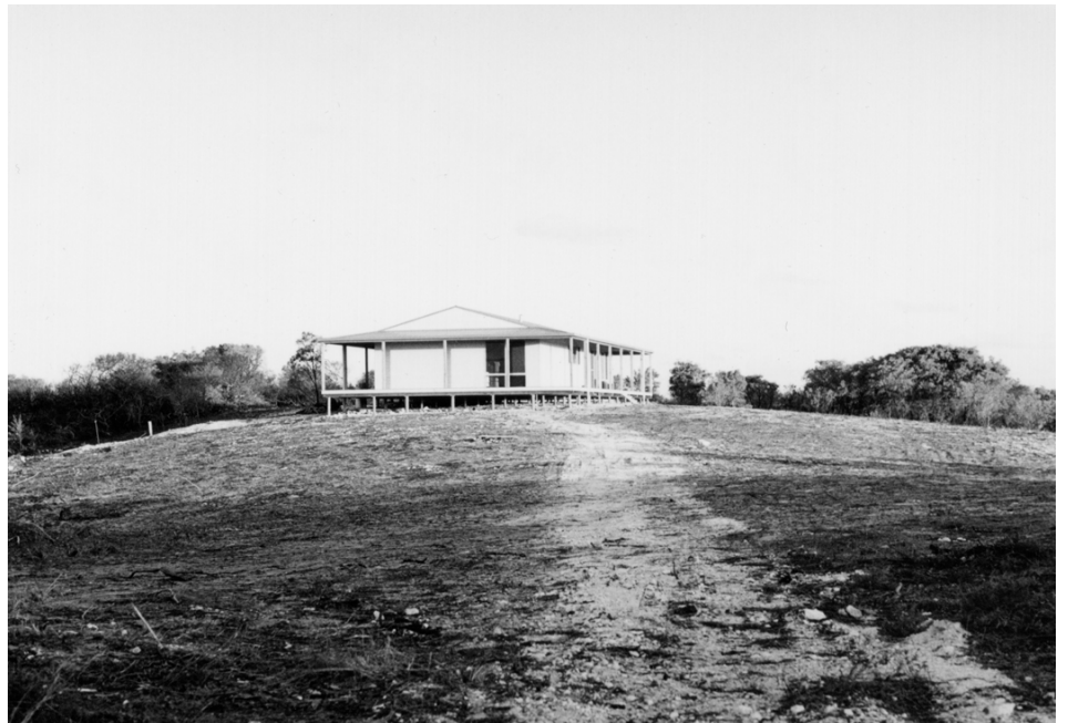
Figure 5: Kwongan clearing on the peninsula.

As the kwongan is negated in these representations so too it is eliminated from the house site. The new homeowner does not acknowledge it, or, it is removed because of fear of fire and to gain access to long-distance views (Figure 5). The outcome of the representation and the inhabitation is the same: the relationship of people to unmediated nature is severed by the objectification of a nature that is 'out there' in the background. Whilst the peninsula and the national park both have biological significance, 'biodiversity' and 'wilderness' are considered as attributes belonging solely to the park. Here, biodiversity is not considered to be where one lives, it is a phenomenon confined to the protected places that one visits. The images shown in Figures 6, 7 and 8 are taken from an exhibition of original landscape representations held at the University of Western Australia in August 2000. Entitled Earth as Light , this project investigated the notion of lightness of earth : an attempt to lighten our perceptions of the earth through mapping and imaging landscape with light-based mediums. Lightness is opposed to heaviness; inferring 'inanimate', 'inert' and 'weighed-down' and, in a less obvious sense, to darkness; light being the medium through which the earth itself is revealed from darkness.