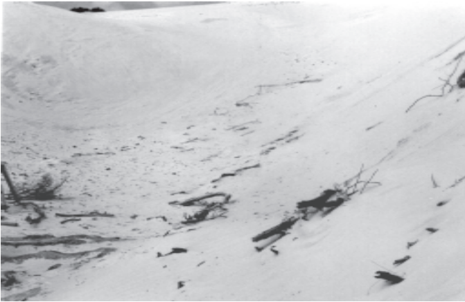
Figure 7: Dune blow-out, still photograph.