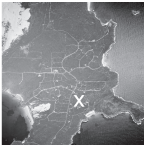
Figure 3: Location of the cartographer's house.