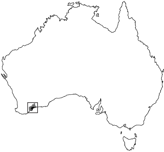
Figure 1: Location of the Fitzgerald Biosphere Reserve.