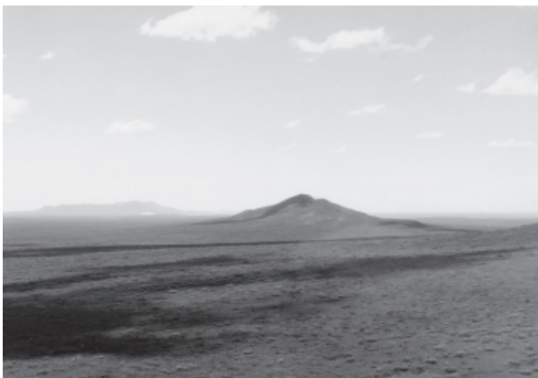
Figure 4: Kwongan heath around West Mount Barren.

Not only is the kwongan misrepresented as an homogenous landscape, it is also feared because of its extreme flammability. As the perceived threat from bush fire increases so too does the removal of the kwongan and, consequently, sedentary modes of inhabitation, which is the work of architecture, have little chance of achieving any proximity with, let alone sustaining, biodiversity.