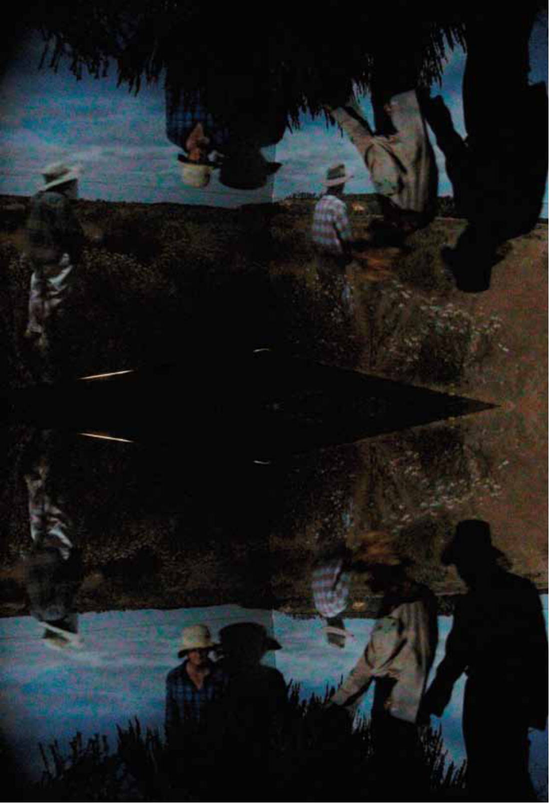
Opposite Five Minutes at Nowanup from Lightsite Room-sized pin-hole camera erected throughout the Fitzgerald Bioregion for the Festival of Perth